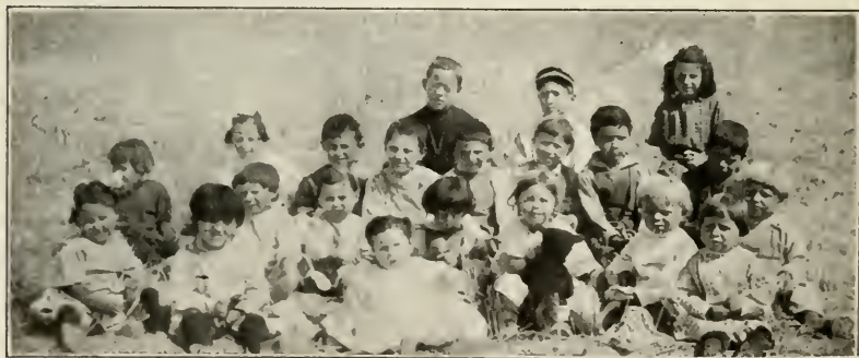
THE BEST CROP OF CLARION

The opening of the Panama Canal, whether near at hand or more remote, will certainly influence immigration to the West. It will be diverted hitherward, away from the now much-crowded Eastern ports of entry. The likelihood of industrial occupation